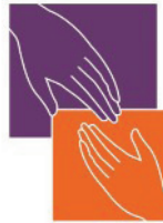
Acts of Mercy